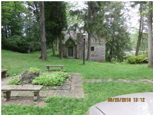
Columbus Chapel with K of C Lamppost