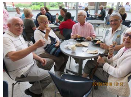
Farewell Snack at Penn State Creamery