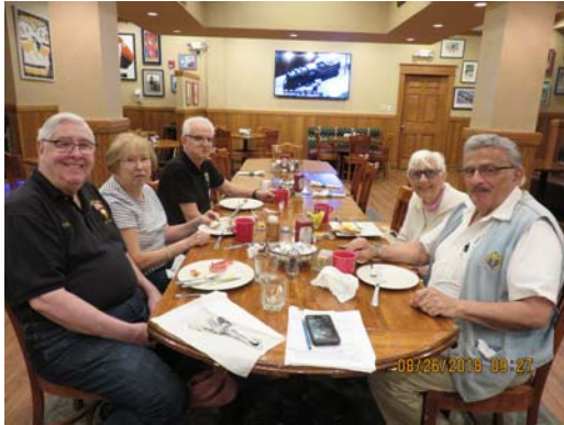
Breakfast at the Ramada Inn