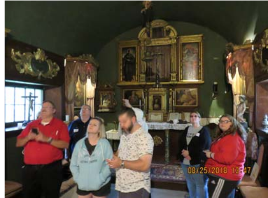
Columbus Chapel Altar